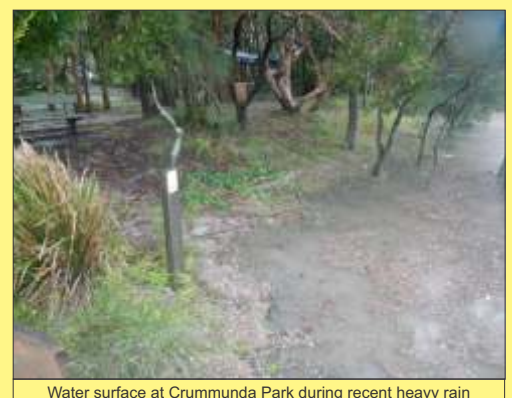
Water surface at Crummunda Park during recent heavy rain

Currimundi Catchment Care Group is compiling a photographic record of stuff floating on the water surface in the creeks, canals and lakes. The photographs together with other information will be used in educational programs on water quality. We invite residents to photograph stuff on the water surface, note the date and location of the stuff and email to cccginfo@currimundicatchment.org.au . Contributions will be acknowledged.