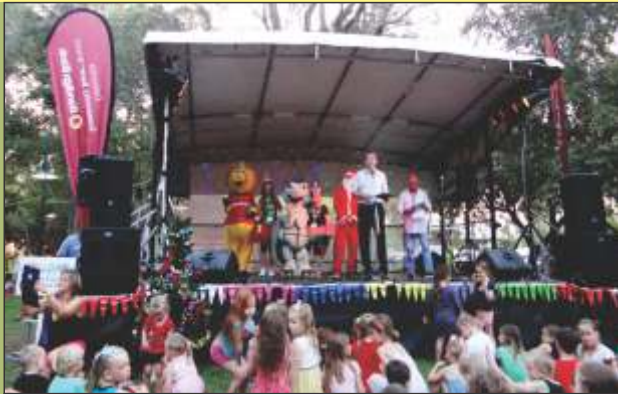
The Hon Jarrod Bleijie, MP, opens Lights on the Lake 2014