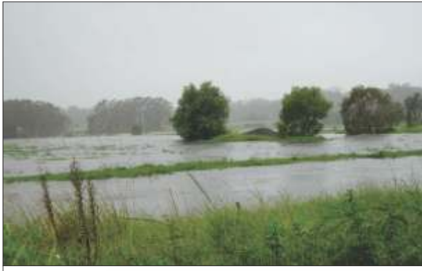
Recent flooding near the playing fields at Meridan Plains

Heavy rain, followed by the tail end of cyclone Marcia, resulted in extensive urban runoff and increased volumes of water flowing through the Currimundi catchment. Like a monster hose gushing through the channels of creeks, canals and lake, the water carried trees, dirt, untreated sewage, animal waste, plastic bags,