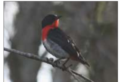
A mistletoe bird photographed in Kathleen McArthur Park

But there's still much to enjoy. Make a visit to Kathleen McArthur Park and you'll be in for a rare glimpse into what this country looked like before development. Help to preserve what is left - go only on foot and stay on the formed tracks, don't litter, and if you see rubbish please pick it up and dispose of it to help our birdlife and turtles.