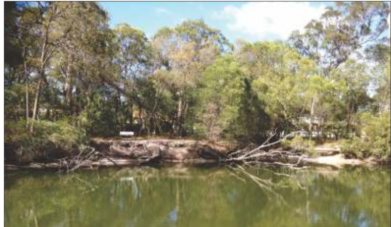
Currimundi Creek South Arm. How much more will we lose?

This is compelling independent evidence of the level of erosion that has occurred in a very short period of time, and it is sincerely hoped that Council will implement the recommendations as soon as possible to halt this ongoing damage.