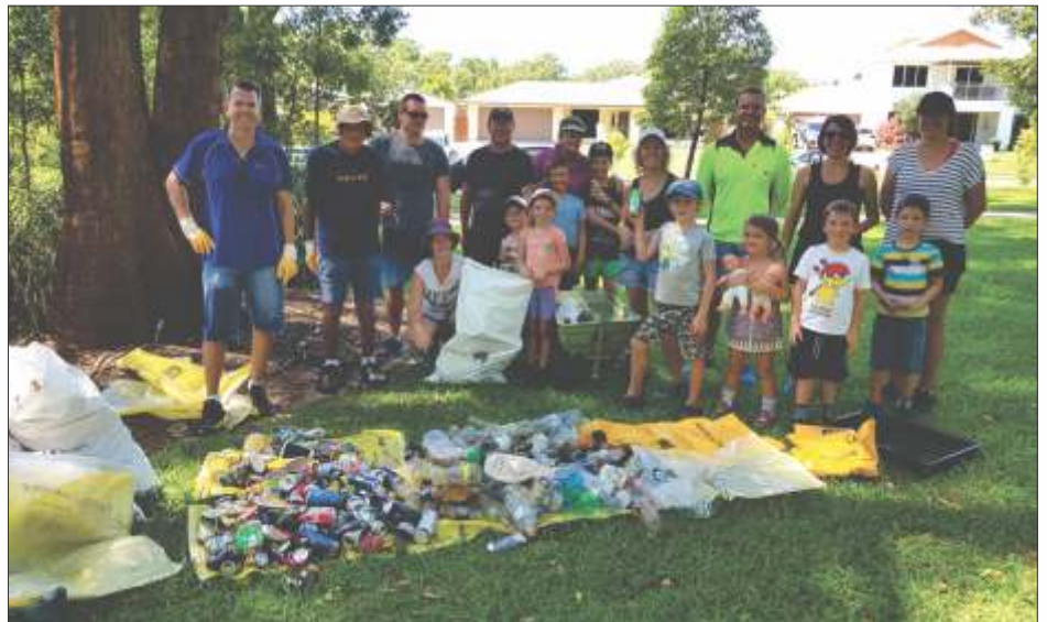
Some of the 500 plastic and glass bottles collected at Little Mountain

It was hot work on the day, but worth it and everyone had fun doing their bit. We really earned our sausage sizzle and cold drink to finish up. Thanks everyone who joined us for the community clean up.