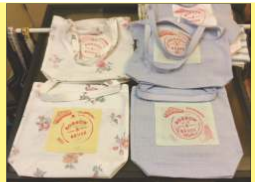
A sample of Boomerang Bags made by the Caloundra group