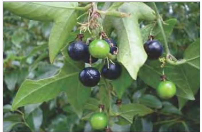
Corky passion flower (Passiflora Suberosa)

The working bees are in different locations in the lake area each time. To find out the meeting place for the next working bee please call Ruth on 549 37903.