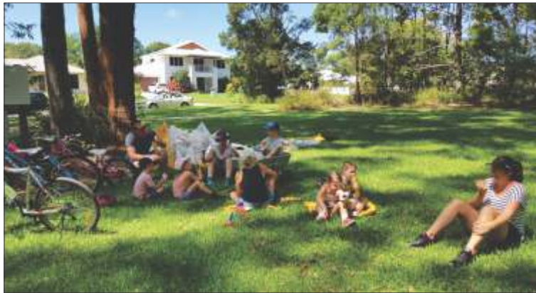
Nothing like a sausage sizzle to wrap up the day's clean up

41 helpers registered to help at the Friends of Currimundi Lake site at Cliff Hargreaves Park from 8.30am. The volunteers were able to cover the open ground as well as the bush, sand dunes, beach, creek banks and roadside. It was encouraging to see young families involved as children joined their parents to comb the high water line to pick up all the very small pieces of litter that are most dangerous to marine life. The Dunes were reasonably clean this year and the general feeling was that our whole area is in good shape.