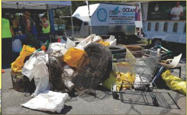
Some of the 600kg of litter collected

It was disappointing to see several large items that had been illegally dumped including tyres, office furniture, plastic outdoor furniture, shopping trolleys and old broken crab pots.