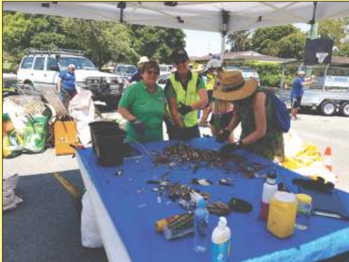
Sorting small pieces into categories to assist further planning

112 participants arrived to help clean up the Lake from their kayaks and canoes, and also on foot along the pathways, starting from the beach front and extending right along Currimundi Creek South Arm to Kawana Way Link Road. What a great effort!